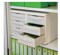
utility drawer unit