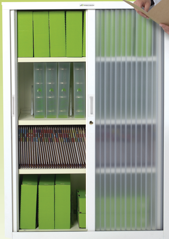
Smartstore G3 4 level 900mm wide

Precision will take your organisation to new heights because organisation is simply about efficiency. Smartstore is so efficient we almost called it the 'personal assistant', but then we didn't want to upset anyone.