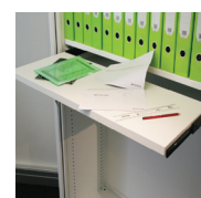
glide out work-shelf