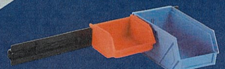
Bin Holder – 400mm plastic – 1200mm steel