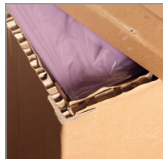
Heavy Duty Packaging