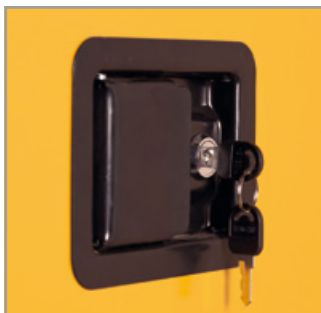
Recessed Door Handle with Key Lock