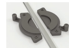
Team Flip - Link Unlocked