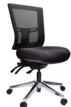
Featuring the Global GreenTag Cert ™ Certified Metro II 24/7 Chair