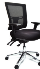
Featured with arms